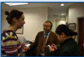
Interviewed by Journal & Courier

Democracy is a complex combination of social and political institutions. The Chinese delegation observed many of the layers and dimensions during their brief visit. Many delegates showed great interest in the operational details of the election as well as the broad ideas and institutional designs of democracy.