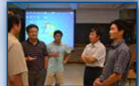
Lectures and discussions