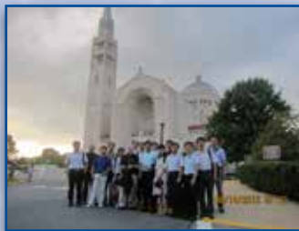
Basilica of the National Shrine