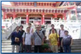
Fung Ying Seen Koon