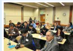
In the forum