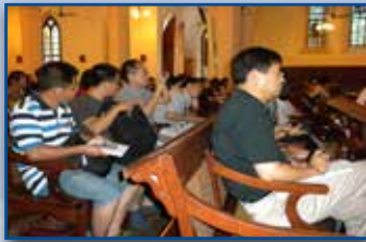
St. John Cathedral